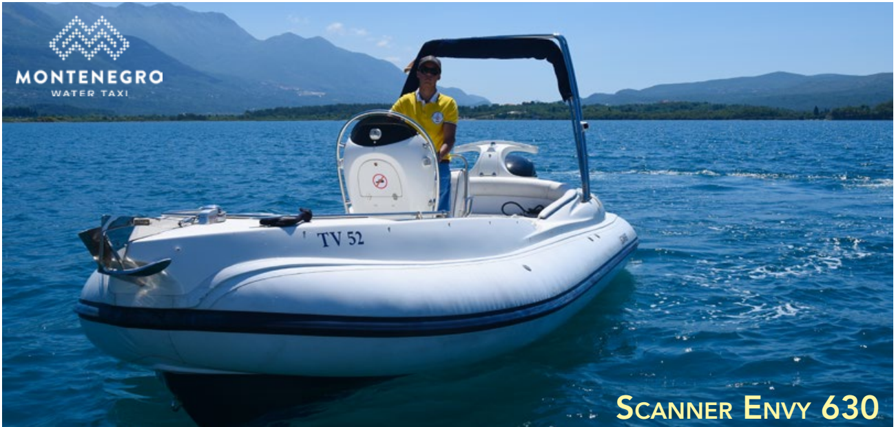
SCANNER ENVY 630