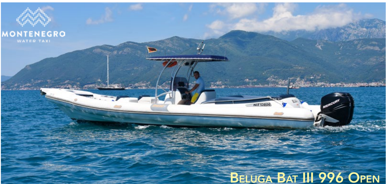
BELUGA BAT III 996 OPEN