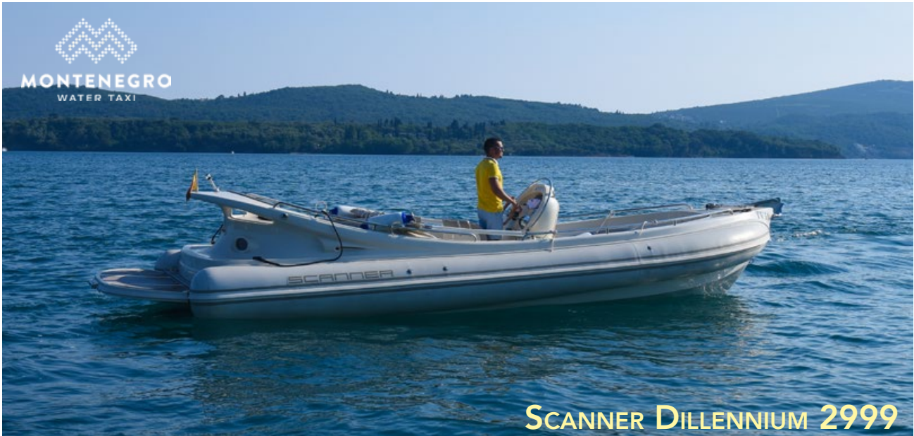
SCANNER DILLENIUM 2999