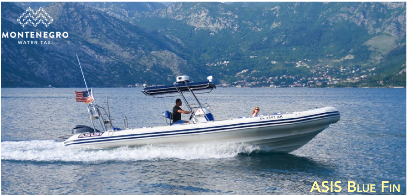
ASIS BLUE FIN